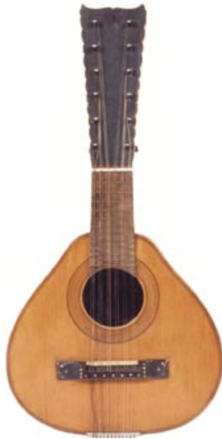
above: A 19 th century bandurria in the Music Museum, Barcelona.

The early American mandolin manufacturers built Neapolitan style bowlback mandolins, but it did not take long until American ingenuity started coming up with new and wonderful ideas for the instrument. One