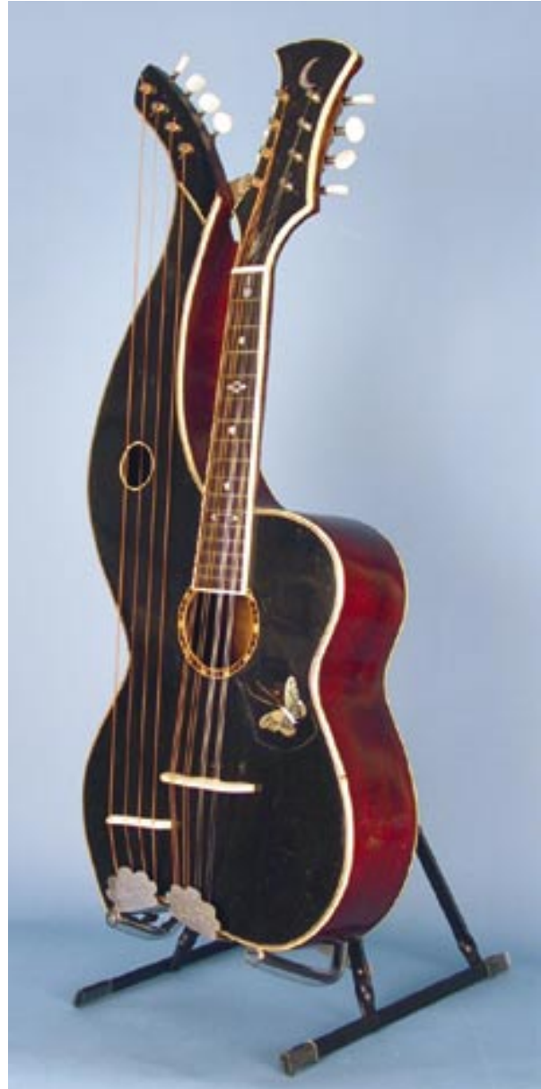
A Knutsen harp mandolin

One other branch line of the mandolin era was the banjo-mandolin, a small banjo body with a mandolin neck grafted on. These were often produced by banjo makers trying to keep a foothold in the market as the interest in banjos dried up in the 1890s. They had one advantage in that they were louder than the Italian style instruments, but there was little else to recommend them. However they did survive, especially from British manufacturers, until the 1950s.