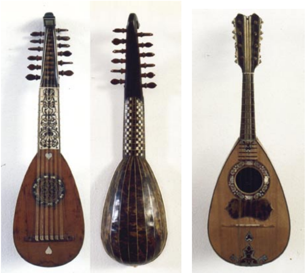
top left: A gut strung mandolino from the 18 th century with a label (almost certainly fake) of Antonius Teppe 1569. String length 321mm