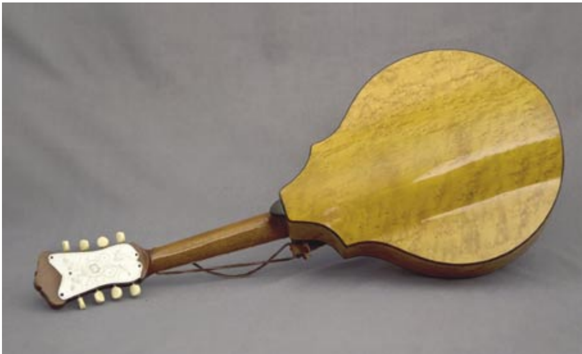
The back of a Vega cylinder-back Mando-lute.

Through the 1920s and 1930s there were also many more basic instruments built with flat backs, often using a bent soundboard