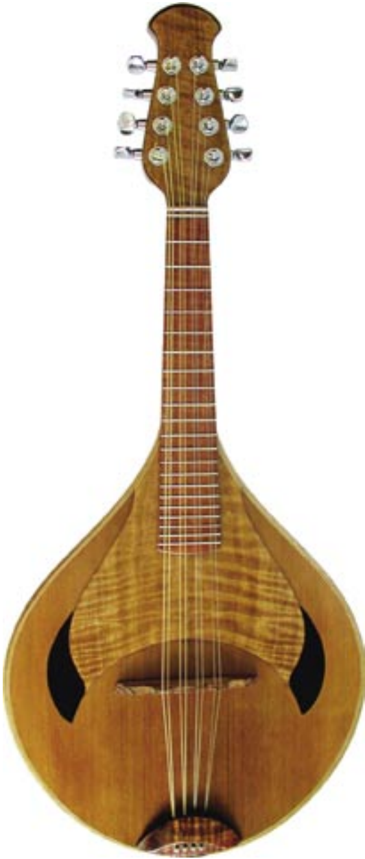
above: An A model mandolin by Tasmanian builder Daniel Brauchli using all Australian timbers and graphite composites.