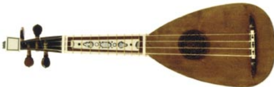
The pictures have been scaled to all instruments are proportionately the same size