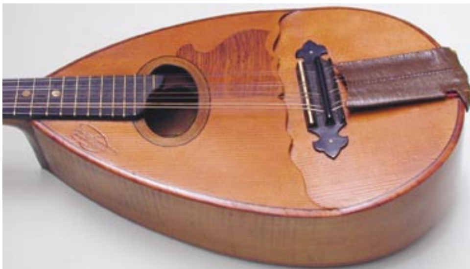
A Gelas mandolin with its unusual double soundboard.