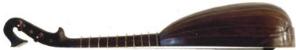
All three instruments are in the Germanisches National Museum Nuremberg