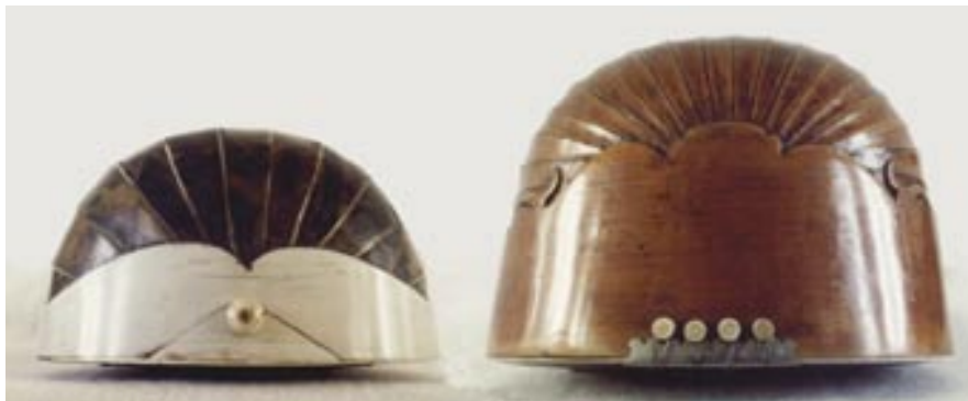
bottom: end view of both instruments

The pictures have been scaled so both instruments are in proportion. Both instruments are in the Germanisches National Museum Nuremberg and the pictures are courtesy of Stephen Morey