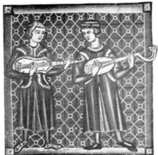
above: Two musicians with guitarras moresca right: Two musicians with guitarras latina or perhaps citoles Both illustrations from the Cantigas de Santa Maria