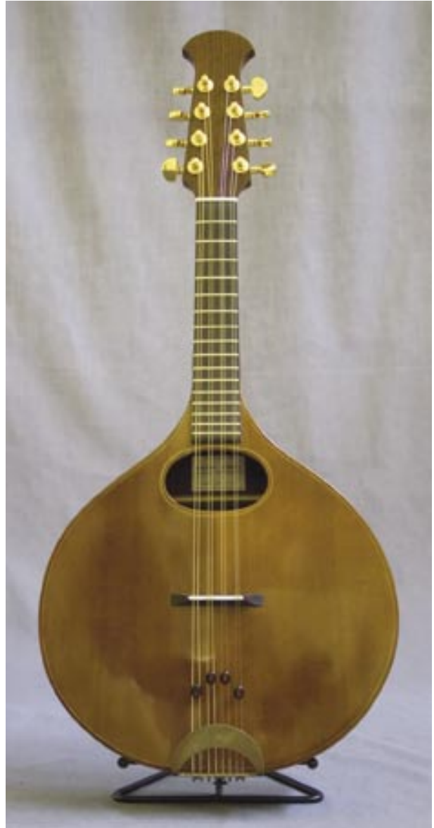
A large bodied Stefan Sobell mandolin.

The mandolin has not, perhaps, regained the popularity it had around the turn of last century, but it is an instrument played in many parts of the world, used in many different styles of music, and with builders pushing the design of the instrument forward as well as those recreating forgotten instruments from several hundred years ago. Whatever the style of music played, these days it is almost certain that the right instrument can be found.