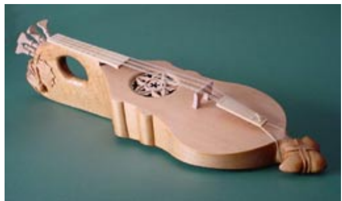
bottom: A modern reconstruction of the British Museum citole by Kate Buehler-McWilliams