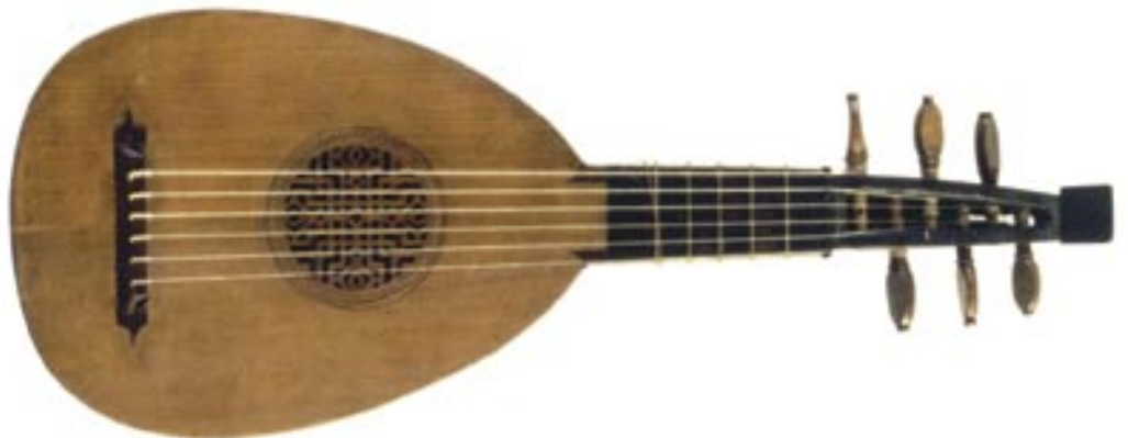
left: A Cremonese mandolin with the label Guippe Tovia Fece In Brescia. String length 320mm