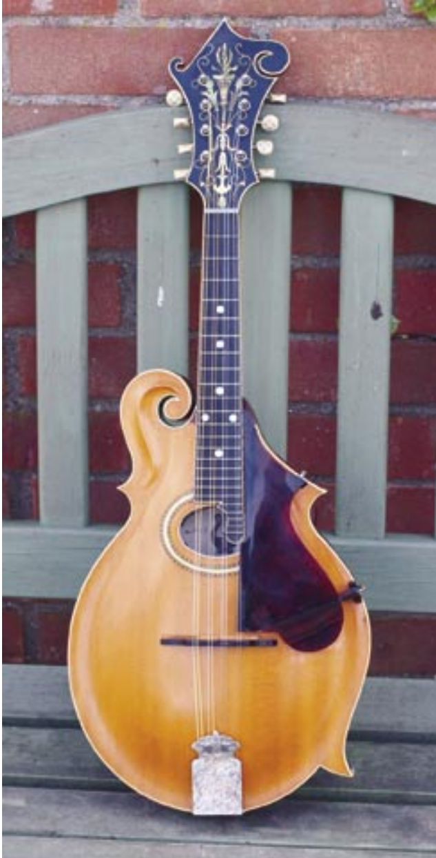
above: A 1912 Gibson F2 mandolin 1910 s.n. 9100,