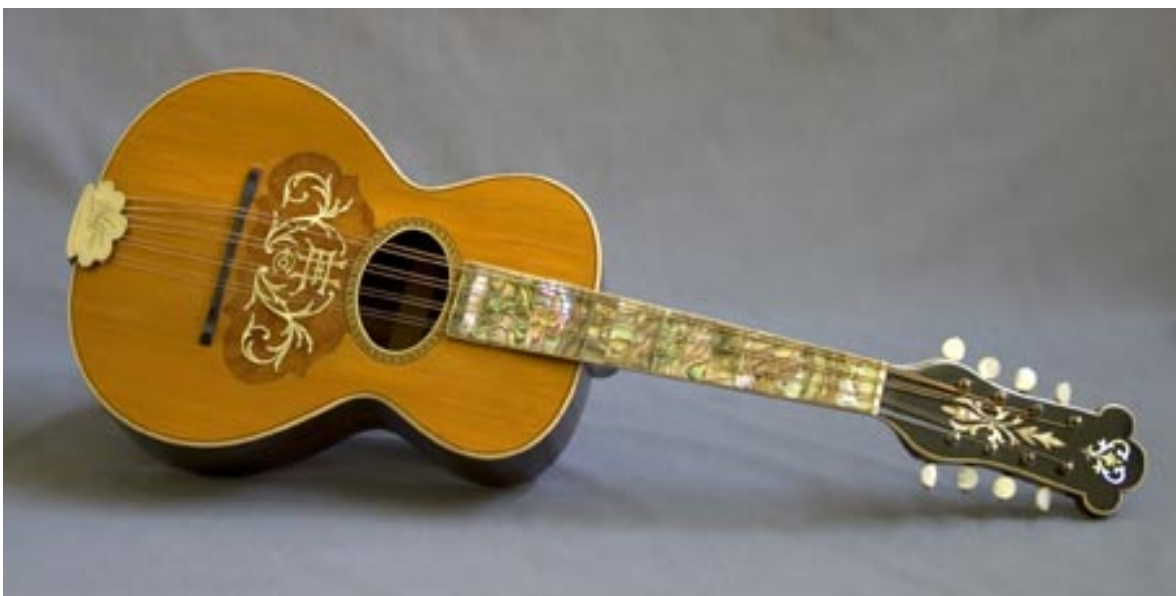
below: A Howe-Orme mandola with a mother of pearl fretboard.