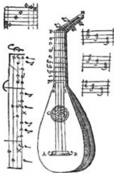
A diagram showing various tunings for the mandore, from Harmonie universalle, by Mersenne, 1636

By 1619 Praetorius was describing these instruments as mandurichen, bandurichen, mandoer, mandurinichen, manduren and pandurina, the latter being a name not seen before or since.