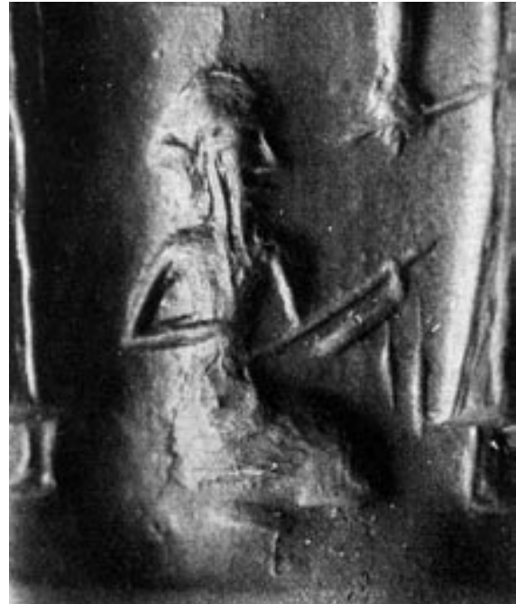
A Mesopotamian clay seal from the Akkadian period 2350-2170BC

By around 1200BC there are suggestions that the body of these instruments were starting to become larger. A relief carving in the Ankara Museum of Ancient Civilizations from the Hittite New Kingdom city of Alaca Hoyuk in Anatolia dating from 1460-1190 BC shows a larger bodied instrument than the Egyptian lutes of around the same period. This larger body might be the start of the evolution into the early form of the Arabic 'ud, and may also be the start of the divergence between short-necked and the long-necked lutes.