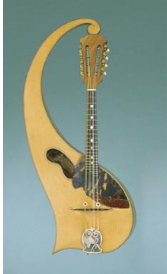
above: A Monzino harp mandolin from the late 19 th century.