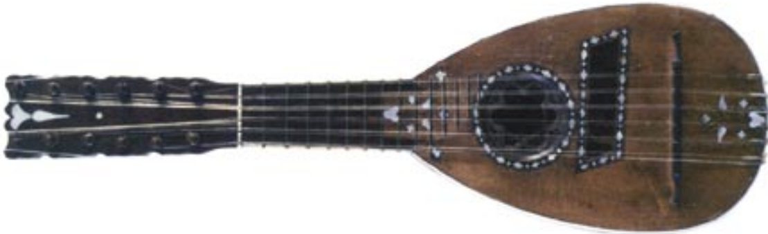
above: A Genoese mandolin (no label) String length 314mm